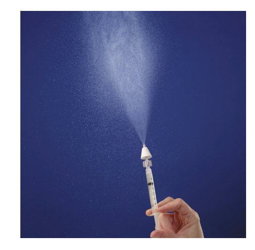
FIGURE 1: Mucosal atomizer device for delivery of intranasal medication (reproduced with permission from Wolfe Tory Medical, Inc., USA).

The study was designed to mirror a real-life patient encounter. A table was arranged at bed height with a mannequin for IN administration and a phlebotomy arm for IV cannulation (Figure 2). A standard advanced paramedic kit bag, containing the MAD, a 3 ml plastic syringe, a 21G